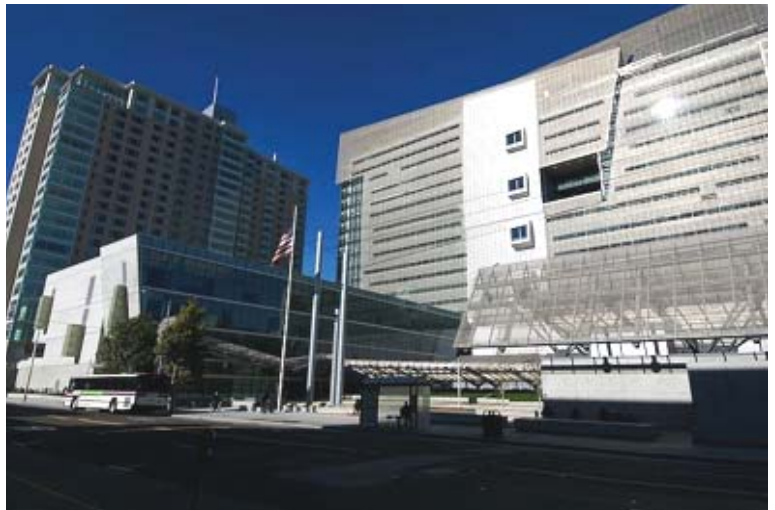
Figure 2: The recently completed San Francisco Federal Building.

The San Francisco Federal Building is probably the first major office building to rely purely on natural ventilation since the advent of air-conditioning in the early 20th century. It was commissioned under the auspices of the Design Excellence Program of the General Services Administration and houses five USA Federal Government agencies. The design documentation explicitly refers to the adaptive thermal comfort model. The building incorporates many innovative technologies including an integrated window wall that maintains internal comfort conditions through natural ventilation, thermal mass storage and passive and active sunshading. The adaptive model of thermal comfort is having an impact on how buildings are designed and constructed.